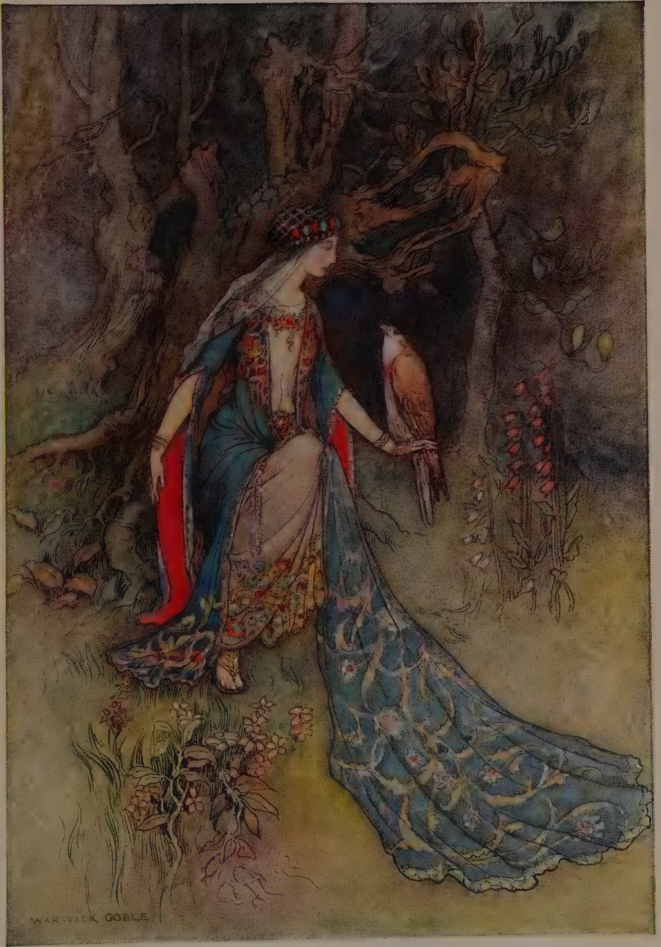
CANACEE AND THE FALCON